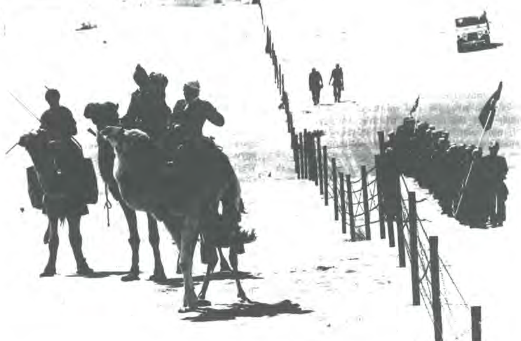
UN troops (on right) and Israeli Camel Corp face each other across border line after 1967 war.

With the signing of a General Armistice the UN admitted Israel to membership on May 4th, 1949, Israel was already 2,268 square miles bigger than the originally proposed partition state.