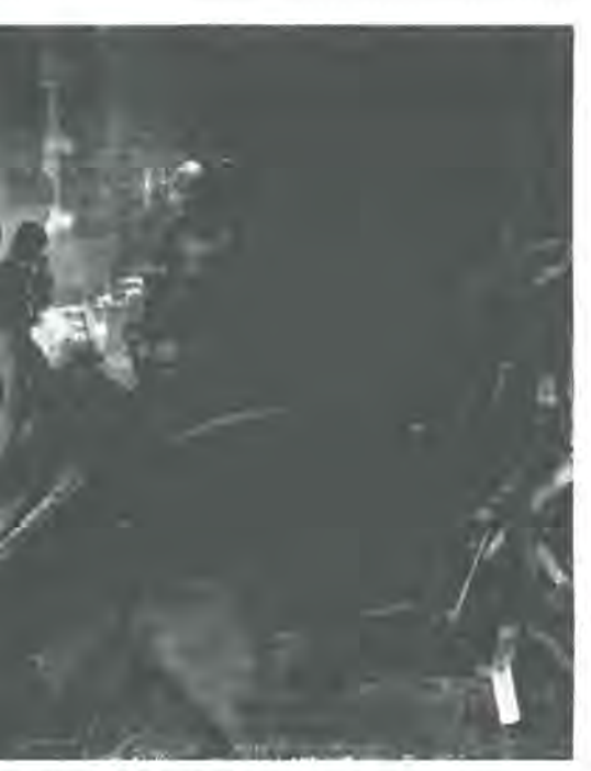
ut after Zionist attack

area. First to crush any anti-imperialist movement in the Middle East and secondly to prevent the USSR gaining a foothold in the region by exploiting Arab-Israeli conflict. Until 10 years ago, the USA thought this was best done by bolstering Israel's military right to cow petit-bourgeois Arab nationalist governments (e.g. Nasser's Egypt.) The Six Day War, 1967 confirmed this, as Newsweek commented at the time, "As an indirect beneficiary of the Israeli blitz, the US should at least be in a position to neutralise the Middle East. so that its oil can be profitably marketed." The next six years saw the heyday of this attitude. The monster, could do no wrong in Frankenstein's eyes. The anti-imperialist pretentions of the Arab regimes were cruelly exposed and their military impotence displayed. The US refused to countenance a return to pre-67 borders.