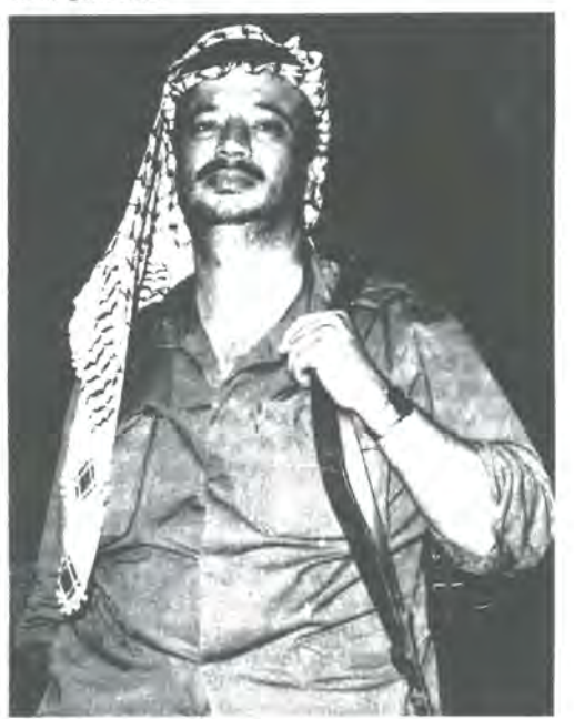
Arafat - PLO leader

The thousands who have fought, arms in hand, to defend Tyre, Sidon and Beirut, the Palestinians of the squalid refugee camps of Lebanon, have been standing in the front line of the battle again against Imperialism and its agents in the Middle East. We salute their struggle. It is the task of the international workers' movement to solidarise with their Palestinian brothers and sisters by actively struggling to undermine and destroy the Zionist state that threatens the Palestinian Arabs with genocide.