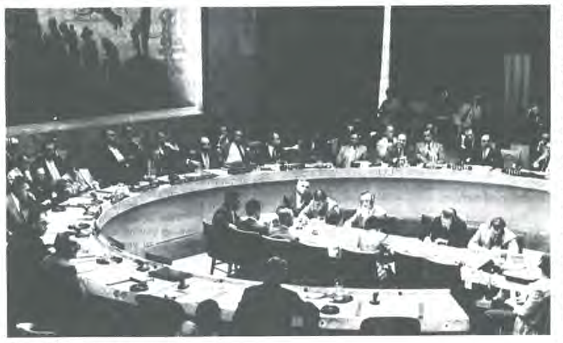
United Nations Security Council in session

He first used the term 'United Nations' to describe the war time alliance against Germany: America, the Soviet Union and Great Britain and it was these three powers which Roosevelt saw as the basis for the creation of a world force that would impose the peace that US capital required. His own conception, originally, was of a global armed force, based on the military power of the Allies, he later added China, under Chiang Kai-shek, to ensure that America would have a majority should differences arise. With regard to the dismantling of the colonial system the role of