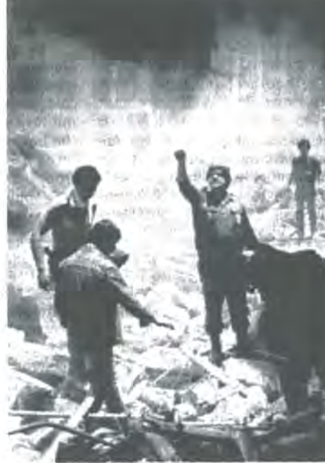
Palestinians searching for bodies amidst the ruins

If Israel is thus a vital and central element of the US domination of the mineral wealth of the Middle East it is not its only concern or agent. Likewise Israel, as an expansionist settler state that can only permanently establish itself by the physical, economic, and cultural genocide of the Palestinians, has interests that clash, on occasion, with those of its US sponsors. Israel's 'security' (read expansion) permanently disrupts the equilibrium of the Arab world. As long as this works to disrupt Arab unity against imperialism this is fine. Should it disrupt the Arab regimes that the US relies upon to control the oil-fields or provide an