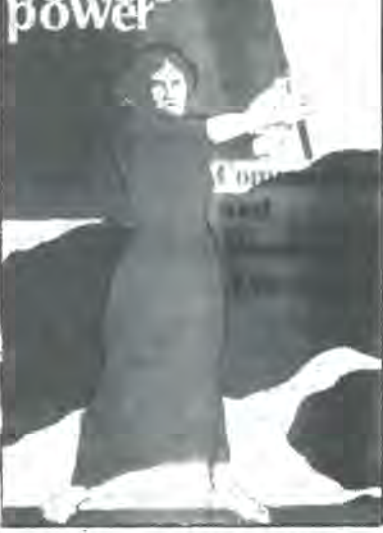
"COMMUNISM AND WOMEN'S LIBERATION'

Send all orders to: Workers Power BCM Box 7750 London WC1N 3XX